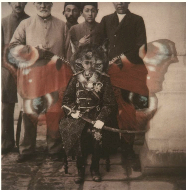
Untitled (Az Div O Dad series, 1976)