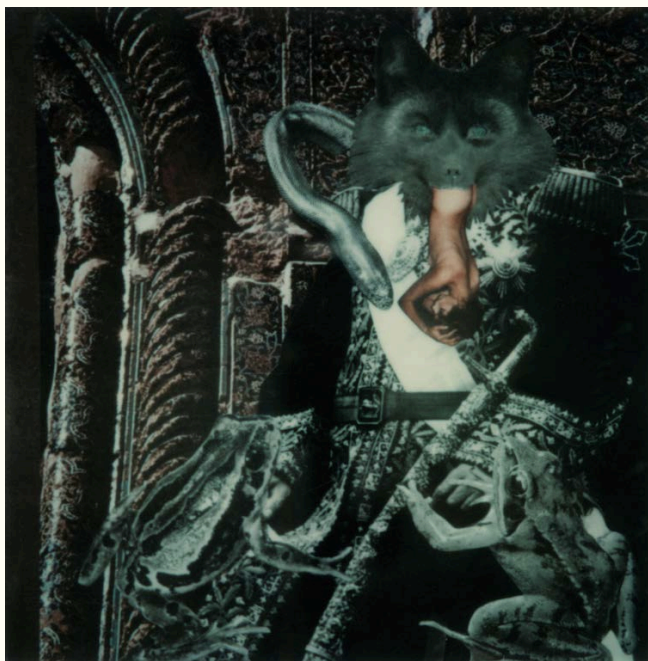
Untitled (Az Div O Dad series, 1976)