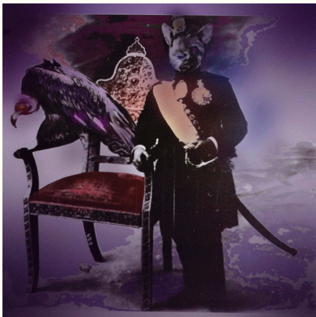
Untitled (Az Div O Dad series, 1976), courtesy Kaveh Golestan Estate