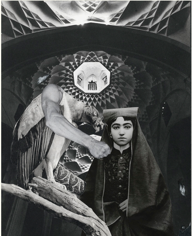
Collage used in creating Az Div O Dad series (1976)