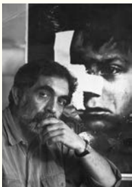
Kaveh Golestan (1950-2003)