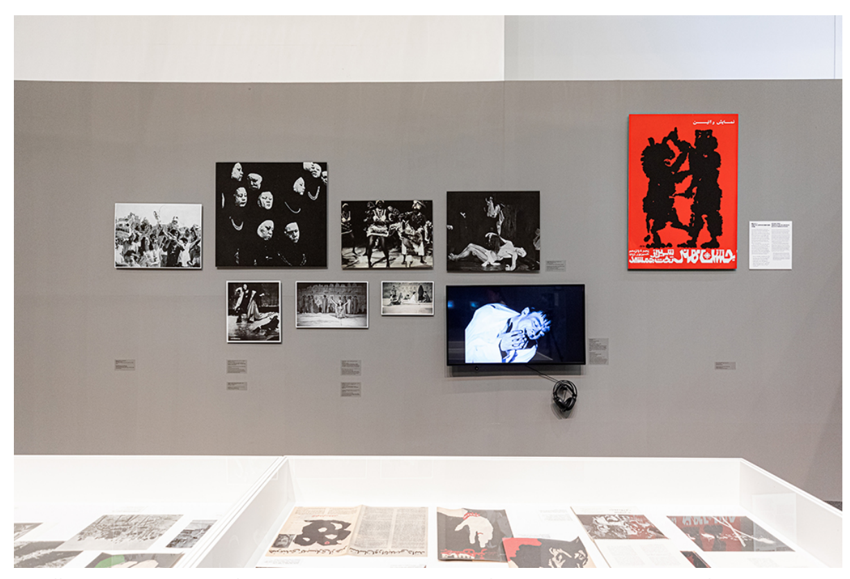
Installation view, Asia Culture Center, Gwangju, South Korea 2020 @ Asia Culture Center

Asia Culture Center, Gwangju 13 May – 25 October 2020