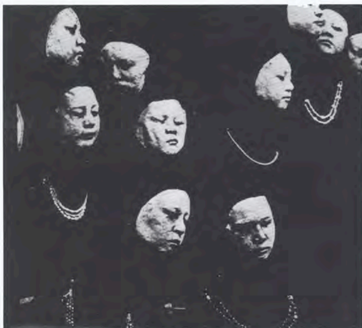
FIGURE 46. Scene from the American production of Fire by Bread and Puppet Theatre, 1970. Image from the catalogue for the Fourth Festival of Arts, Shiraz, Persepolis 1970.