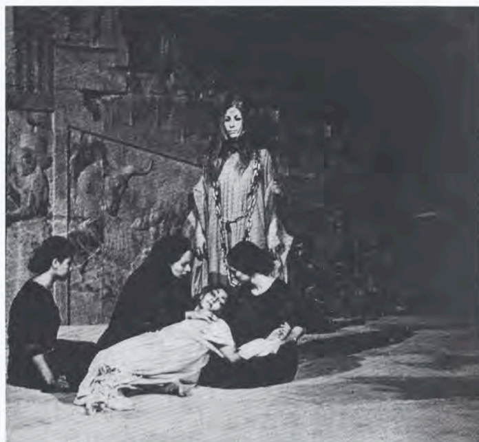
FIGURE 47. Scene from the Iranian play Vis and Ramin adaptation by Mahin Tajadod and directed by Arby Ovanessian. Image from the catalogue for the Fifth Festival of Arts, Shiraz, Persepolis, 1971.