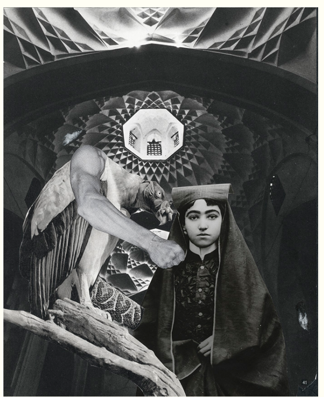
Collage used in creating Az Div O Dad series (1976)