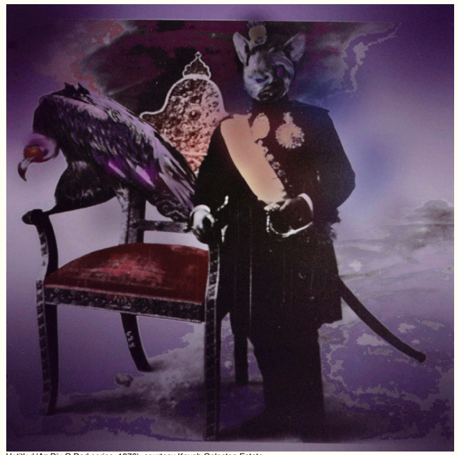
Untitled (Az Div O Dad series, 1976), courtesy Kaveh Golestan Estate